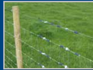
Install and repair field fence with Gripple Plus