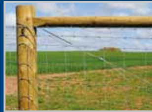
Brace box strainers with a Gripple Bracing kit