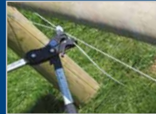
Apply tension with a Contractor Tool