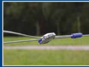
Join and tension wire using a Gripple Plus