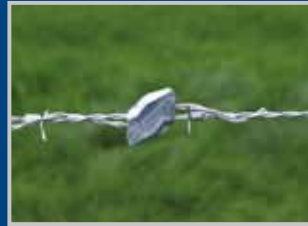
Join and tension barbed wire using Gripple Barbed