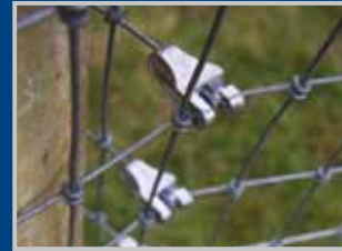
Terminate at an end post with Gripple T-Clip